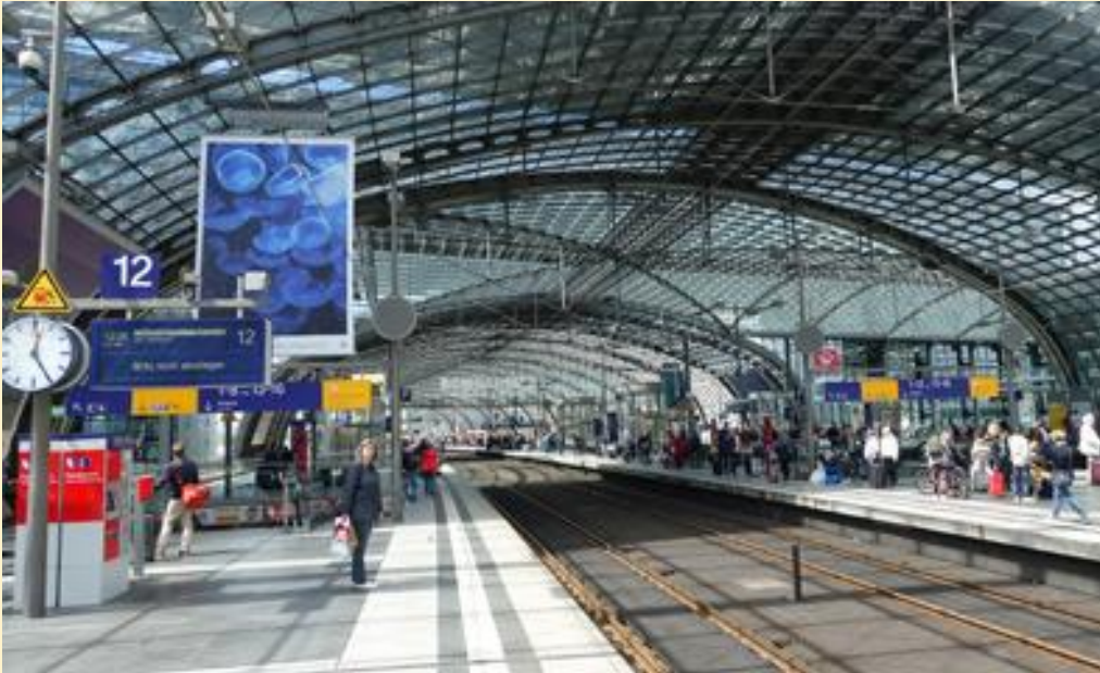
Berlin Hauptbahnhof (Hbf)