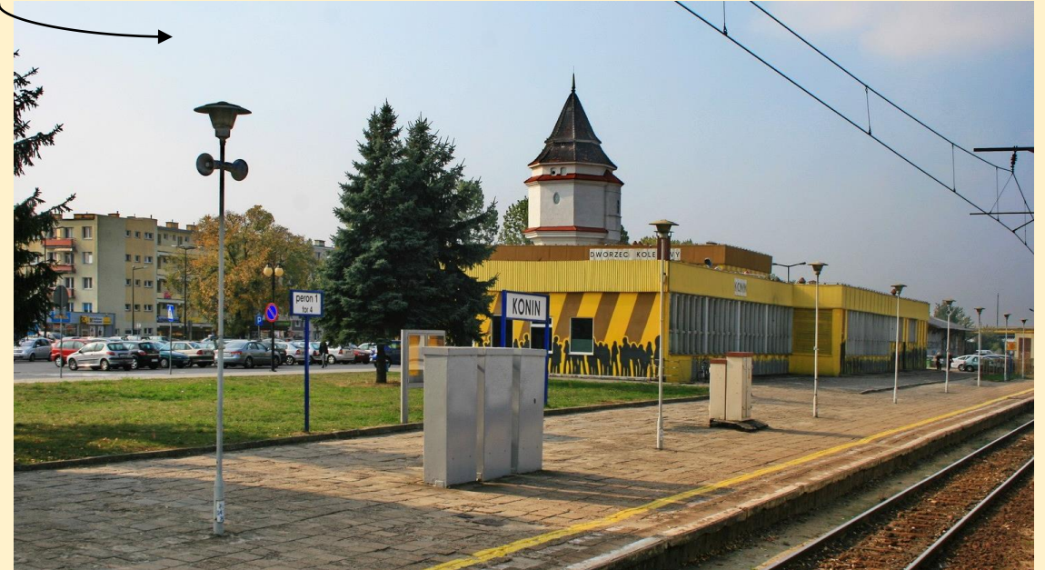
Konin Konin Railway Station

Notice: the trip may require train changes