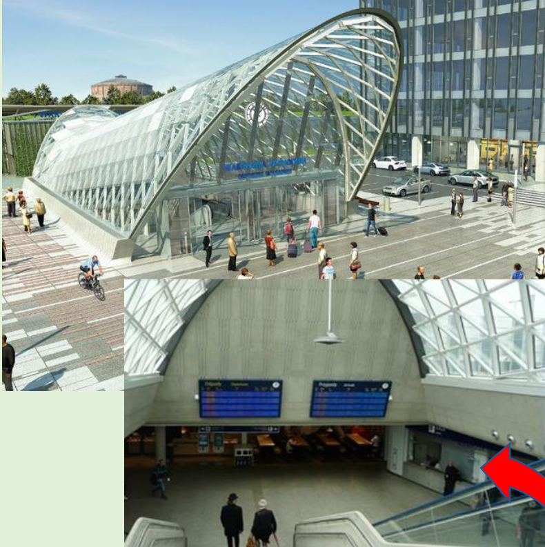
Warszawa Zachodnia Train Station

For Warszawa - Konin train you can buy ticket here: https://rozklad-pkp.pl or https://bikom.pl/ or at ticket office at Warszawa Zachodnia